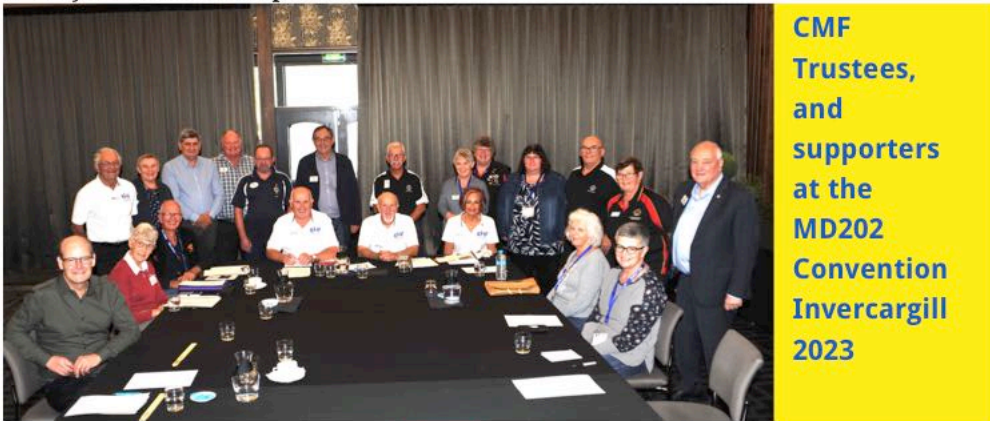
CMF Trustees, and supporters at the MD202 Convention Invercargill 2023

LIONS ARE CMF. Yes! the success of helping the children is due to the ongoing support of Lions in New Zealand, who volunteer to help, fundraise and provide members to serve as Trustees and District Chairpersons. To learn more about applications, fundraising, donations, how to help, go to www.nzcmf.org or see your District Chairperson.